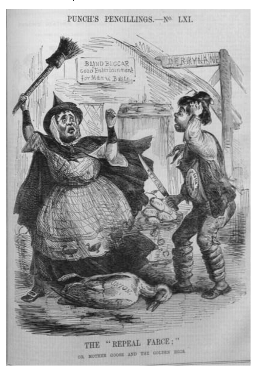
Fig. 1 "The 'Repeal Farce'" (Punch 4.37)

public spheres and the home, affirming his inherent authority over women (69-71). In other words, masculine resiliency is based both on man's inherent rationality and his authority. Thus, these two depictions of O'Connell rob him—and Ireland—of power in two interrelated ways. First, it associates the political push for freedom with feminine emotion and its accompanying irrationality, which become non-threatening because it is "woman" who is attempting to wield the authority in the home. Second, this home is not within England's border. In short, these images are entertaining and not frightening because O'Connell lacks political power if he is feminized both in character and sphere.