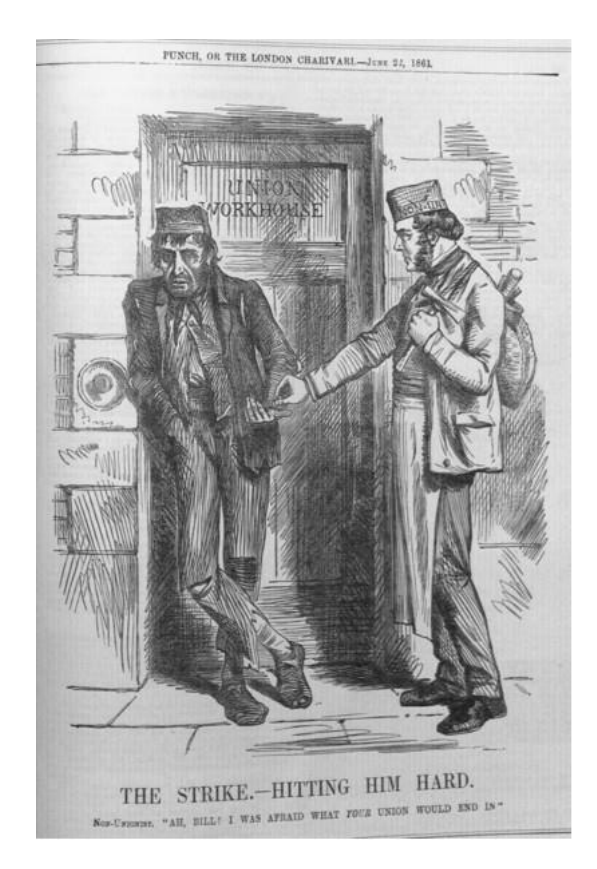
Fig. 8 "The Strike – Hitting Him Hard" (Punch 40.263)