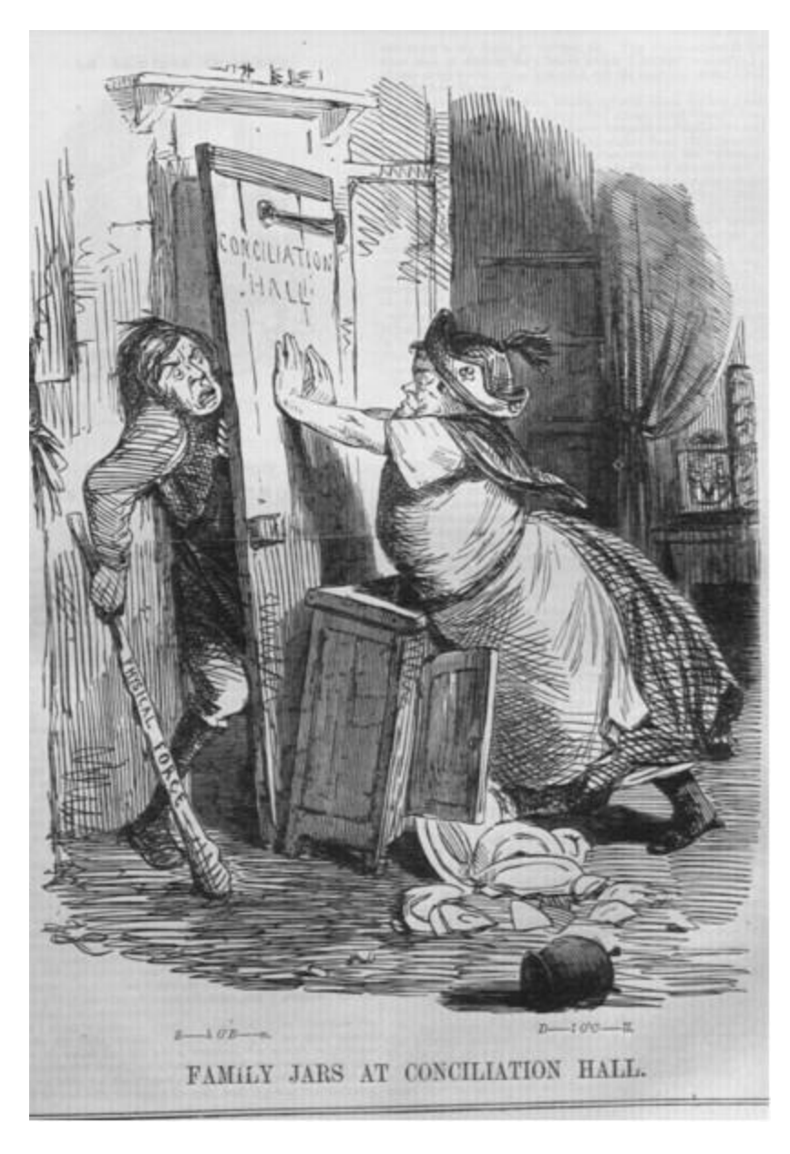
Fig. 2 "Family Jars at Conciliation Hall" (Punch 11.119)