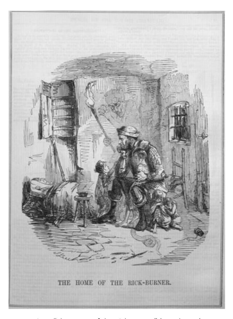
Fig. 4 "The Home of the Rick-Burner" (Punch 7.17)

<18>Because Leech's illustration also emphasizes the domestic space, maternal duties, and the lack of tools, however, it does more than simply "unsex" the laborer; he becomes a non-threatening figure because of his loss of manly authority. He does not rule over the house but is instead confined by it. From the bars on the small window on the left to the claustrophobic presence of the ceiling, the laborer is completely imprisoned. While Satan might tempt him to burn as a desperate act, he cannot actually do so while he is trapped in the domestic space. Unlike the idealized and glorified images of the male laboring body with sleeves rolled up and veins protruding from muscular arms, such as the navvies in Ford Madox Brown's Work , this worker is weak and emaciated, and he holds children, not tools. These are all signs that he has been robbed of his masculinity. As such, he is an object of weakness, a victim who elicits charity and pity, instead of a protestor who is a threat. One might argue that the title implies this