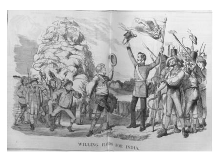
Fig. 9 "Willing Hands for India" (Punch 33.88-89)