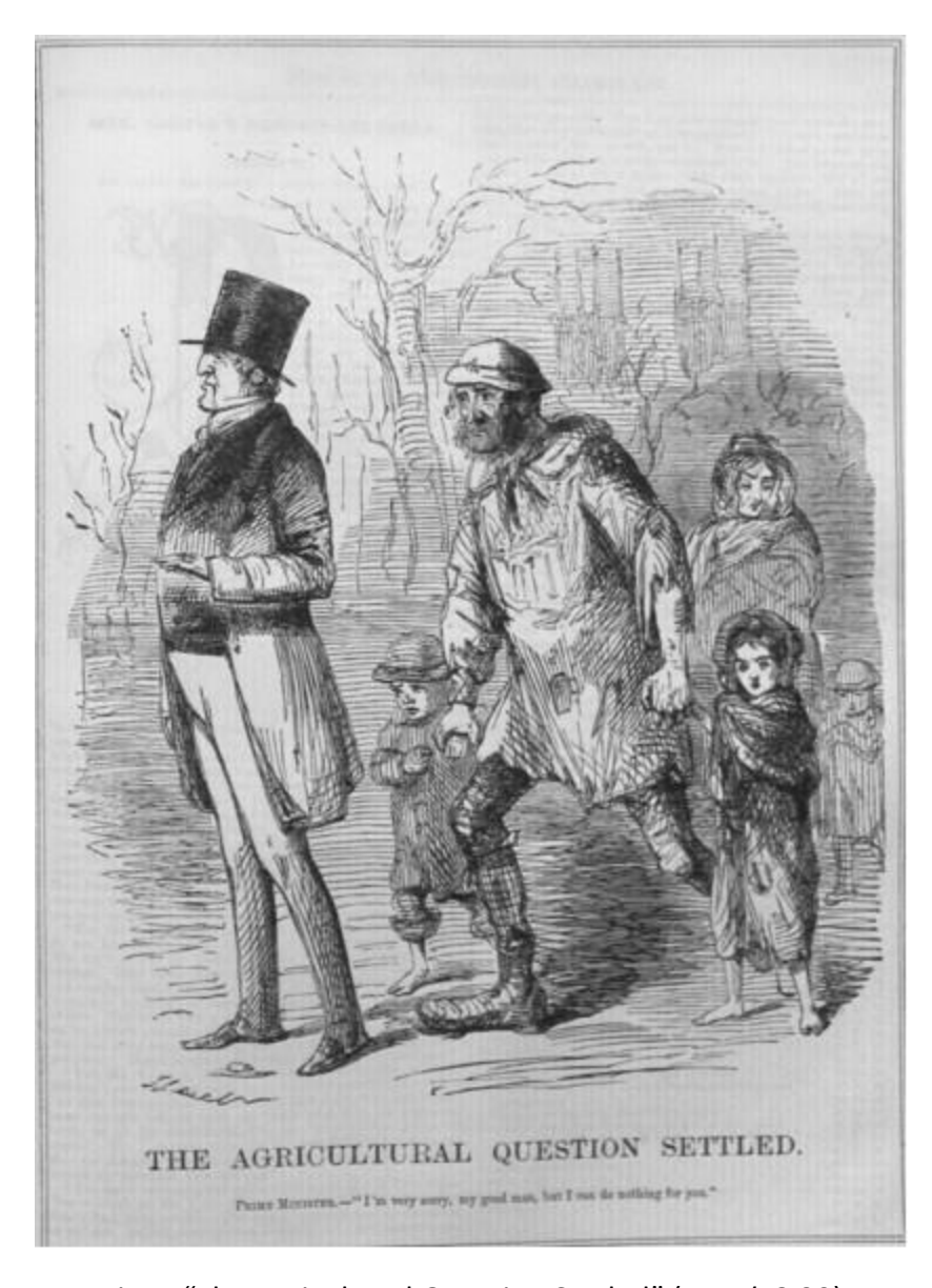
Fig. 5 "The Agricultural Question Settled" (Punch 8.39)

<20>Punch illustrations of the victimized male laborer compel the upper classes to find solutions. However, the illustrations change when addressing the working classes' attempts to find solutions, specifically through the social movement and unions. The laborer is still emasculated, but instead of removing his authority by confining him to home and children, his emasculation in these illustrations points to his lack of manly sexual character, to his moral degradation because he chooses notto work. Working-class movements continued to grow throughout the mid-1800s, mostly through trade unions, despite the failure of Chartism. In the first half of 1861, Punch published a series of three pictures tracing the detrimental effects of strikes. Like the visual narrative sequences of predecessors like William Hogarth and George Cruikshank, in which a series of pictures visually mark the progressive deterioration of a