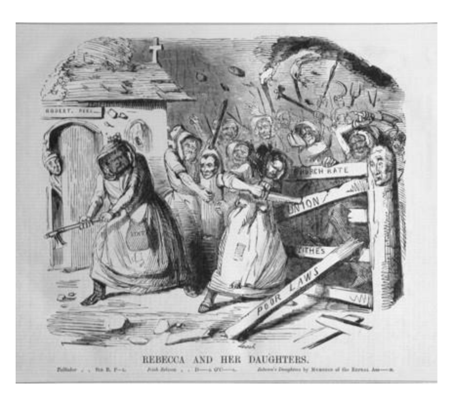
Fig. 3 "Rebecca and Her Daughters" (Punch 5.5)