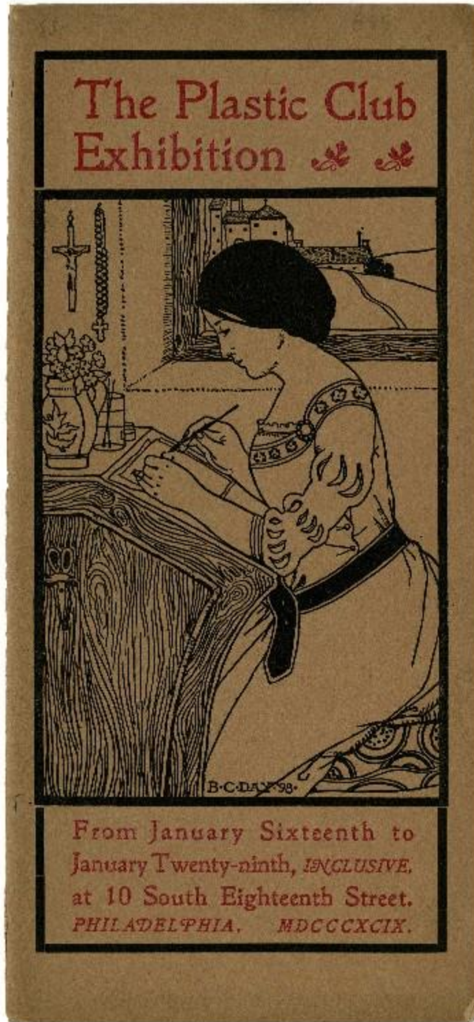
Figure 7. Bertha Corson Day, cover design for the Plastic Club Exhibition Catalogue, January, 1899. Historical Society of Pennsylvania, Philadelphia.