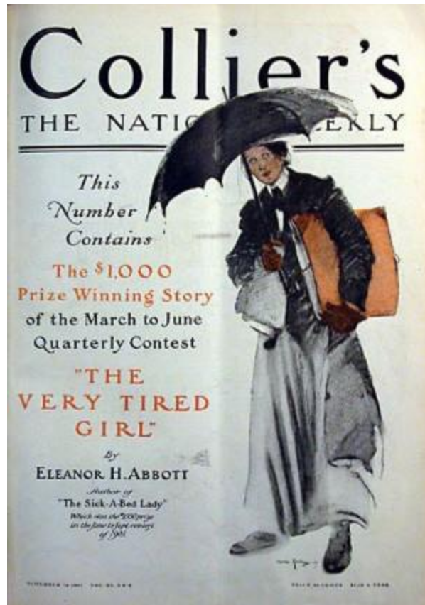
Figure 3. Charlotte Harding, cover illustration from Collier's Weekly Magazine 40 (November 16, 1907).