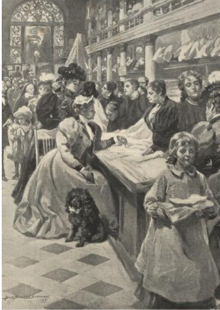
Figure 2. Alice Barber Stephens, The Woman in Business . Cover illustration from Ladies' Home Journal 14 (September 1897).