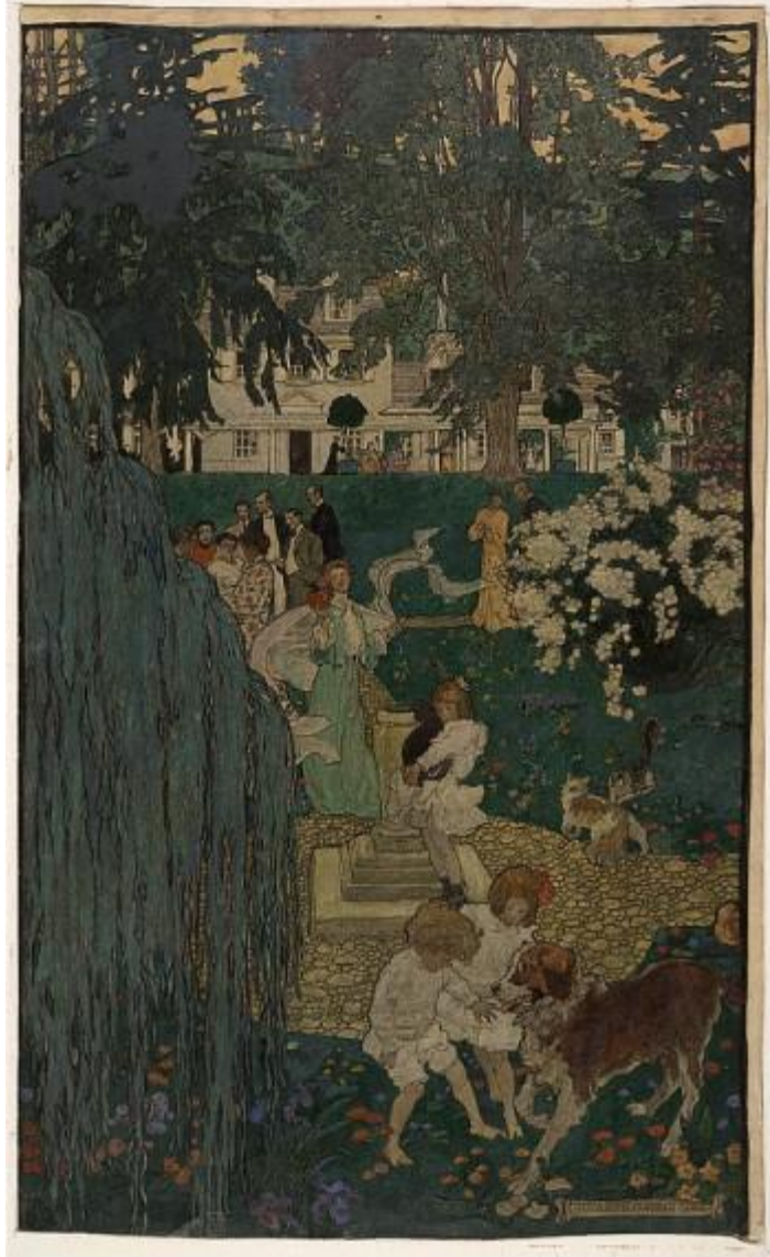
Figure 5. Elizabeth Shippen Green, Life Was Made for Love and Cheer , 1904. Watercolor and charcoal on illustration board, D size. Cabinet of American Illustration, Prints and Photographs Division, Library of Congress, LC-DIG-ppmsc-04735.

<18> Although their domestic environments cultivated images of artful lives and feminine propriety, the home-based suburban studios of Green, Oakley, Smith, and Stephens were efficient, organized, and utilitarian. The ornate, cluttered Victorian furnishings of their earlier, heavily decorated Chestnut Street studios were replaced by clean-lined furnishings and the accoutrements of busy artists. Their shift away from earlier ornate spaces to more spartan, functional studio interiors is indicative of the large-scale demise of the sumptuous studio among American artists at the turn of the twentieth century. The transformation of their studio spaces from genteel settings to more functional “workshops” may also have signaled an effort by women illustrators to shed the trappings of feminine domesticity—“ornamental” and “decorative” rooms—for “sincere” and “authentic” symbols of masculine