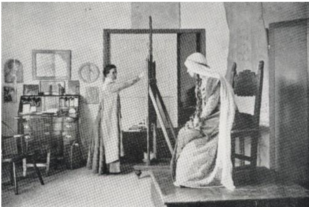
Figure 6. Photograph of Elizabeth Shippen Green at work in her studio at the Red Rose Inn. Reproduced in "Modern Magazine Illustrating," Harper's Weekly Magazine 46 (August 9, 1902): 1060.

professionalism (Kinchin 12-29). Photographs of the women in their simply furnished, efficient studios (fig. 6) validated the women's artistic integrity. Any notions of irrationality or female dabblers were dispelled by the tidy workrooms of hardworking artists. Descriptions of the studios of Smith, Oakley, and Green at their subsequent residence "Cogslea" in Mt. Airy bear out these gendered associations. A 1917 Good Housekeeping article on Smith declared that her "great studio" was "spacious, high-ceilinged—essentially the room of a big mind" with a "sense of repose and power" (25). Similarly, critic Charles Caffin characterized Oakley's studio as "a workshop such as any man-painter would be glad to own, and arranged as he would have it, if his work were the main thing he kept in view. . . . the air of the place is one of practical and sincere work" (473).