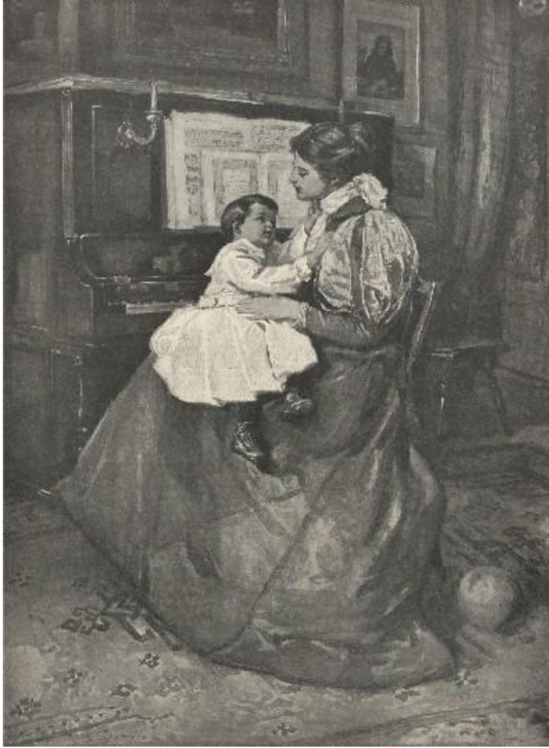
Figure 1. Alice Barber Stephens, The Beauty of Motherhood . Cover illustration from Ladies' Home Journal 14 (November 1897).