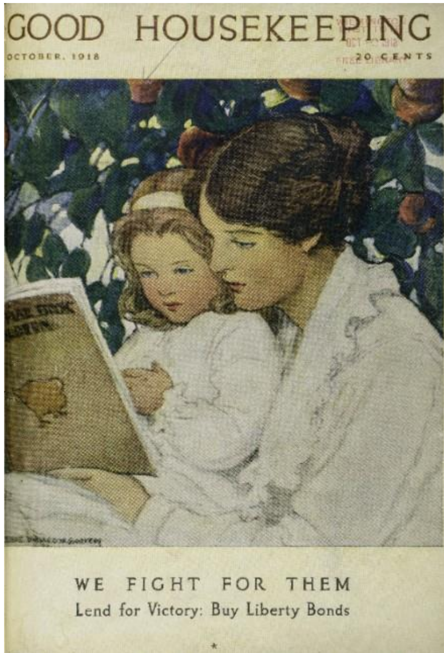
Figure 10. Jessie Willcox Smith, cover illustration for Good Housekeeping (October 1918).